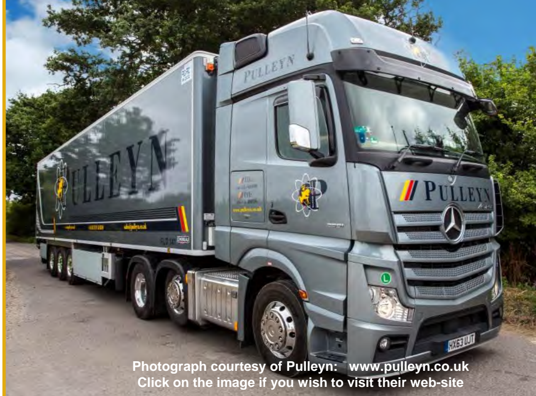
Photograph courtesy of Pulleyn: www.pulleyn.co.uk Click on the image if you wish to visit their web-site

Radisson Blu Royal Hotel, Dublin, Ireland 20, 21 & 22 May 2025