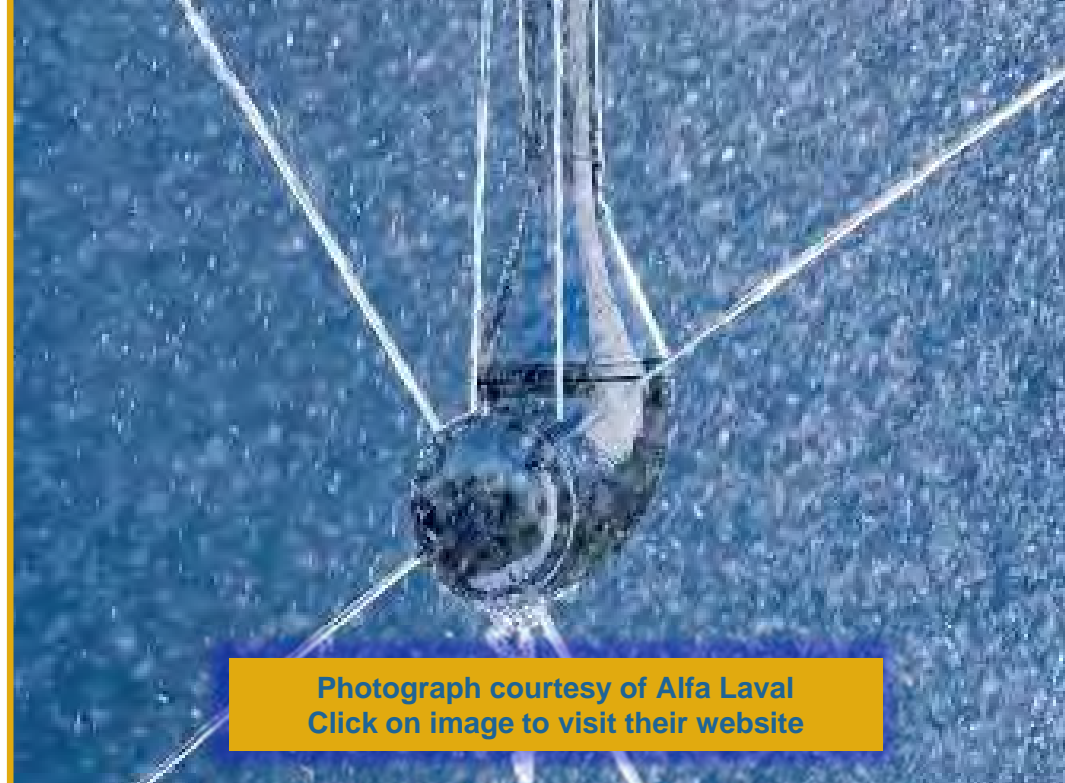
Click on image to visit their website